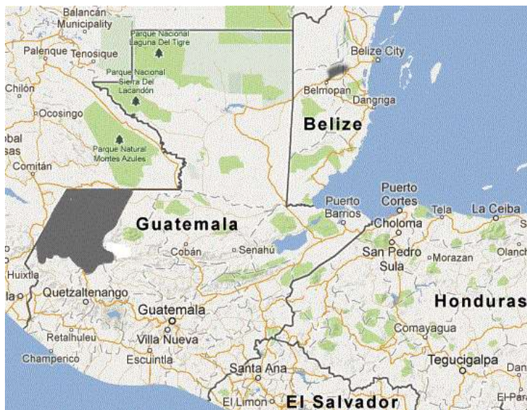
FIGURE 1: MAP OF GUATEMALA WITH HUEHUETENANGO HIGHLIGHTED

Chuj is spoken primarily in Guatemala by around 40,000 people. Chuj speakers in Guatemala are located in three municipalities: San Mateo Ixtatán, San Sebastián Coatán and Nentón. All three municipalities are situated in the department of Huehuetenango, the area highlighted in the Google map in Figure 1: